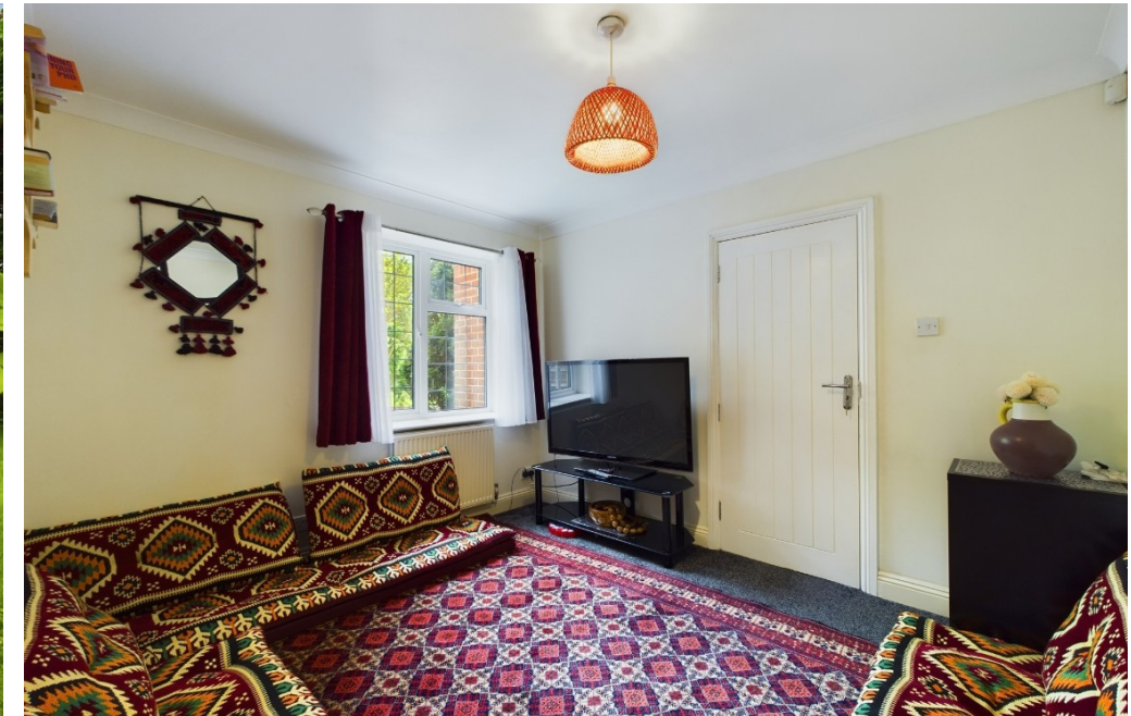
Property details: Offington Lane | Worthing